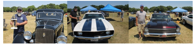
2023 People's Choice Awards