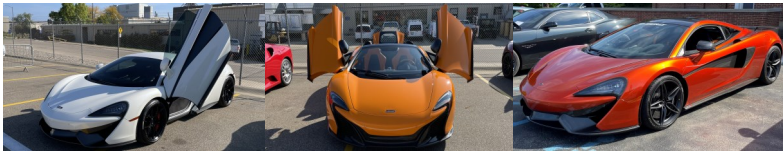
New 2024— Supercars from Southwest Michigan Cars & Coffee