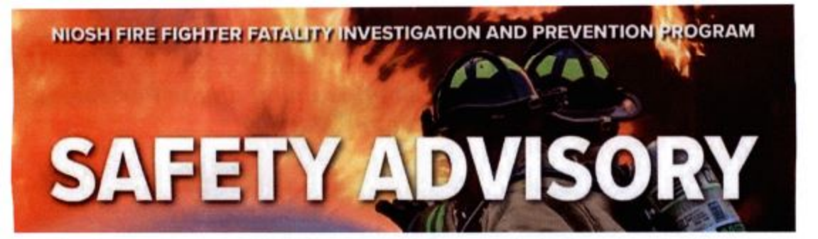
The Importance of Understanding and Training on the Portable Radio Emergency Alert Button (EAB) during a Mayday.