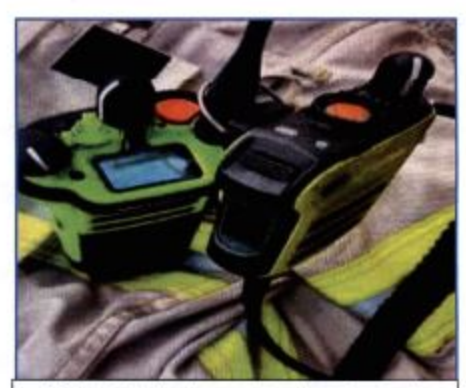
EAB (orange buttons) on a radio and remote speaker microphone.