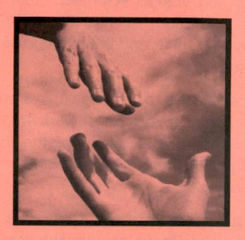
A Service of the Berrien County Sheriff's Office